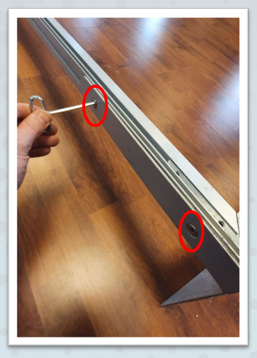
2: take out the screws at the side (4 screws)