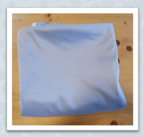
4: fold the backdrops