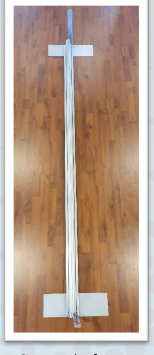
3: store the frame