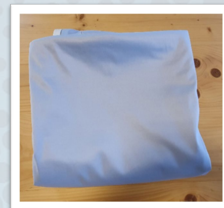
4: fold the backdrops