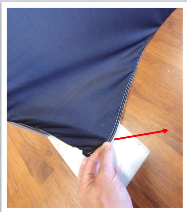
1: Pull the backdrop out at the corner

NOTE: if you have the space to store the frame in one piece, it is the best (and quickest) option to store it in one piece.